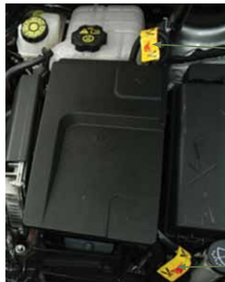
3. Cut auxiliary power module cable