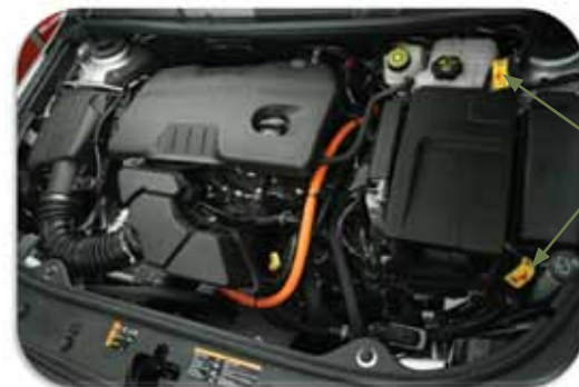
Yellow Cut Tape Labels

To disable the low voltage system, cut through the low voltage cables on each side of the yellow labels to remove a section of the cable to ensure the cables cannot inadvertently reconnect.