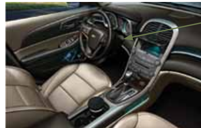
1. Use key or push button to turn off ignition

To avoid accidental reconnection of the cut cable, remove a section of each cable to ensure they cannot inadvertently reconnect.